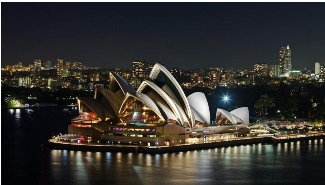
ICONIP 2019 Venue - Sydney, Australia